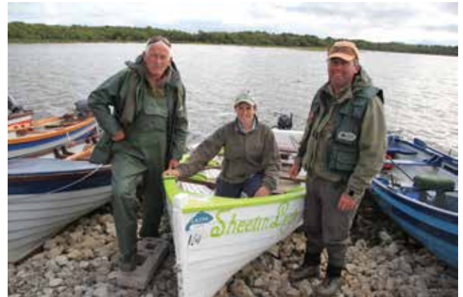
Three generations of O'Keefe's