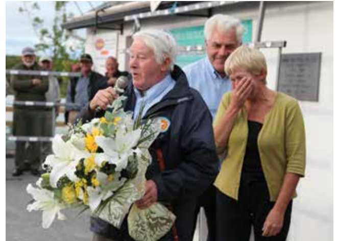
The President's Speech