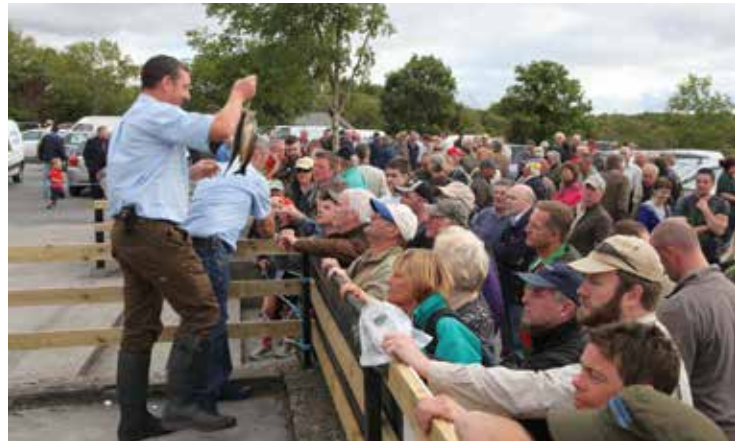
Section of the crowd

Westport Country Lodge, Aughagower, Co. Mayo, T: 098-56030 E: reception@westportcountrylodge.ie W: westportcountrylodge.ie